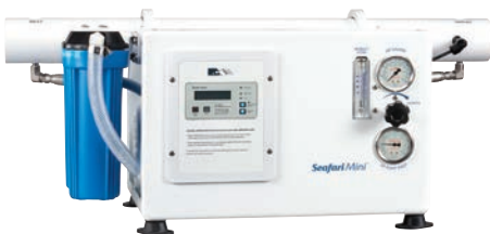
Mini - compact

WARNING: This product can expose you to chemicals including Di(2-ethylhexyl)phthalate (DEHP), which is known to the State of California to cause cancer and birth defects or other reproductive harm. For more information go to www.P65Warnings.ca.gov .