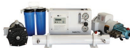
Mini - modular