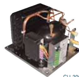
Adler/Barbour CU-200 ColdMachine