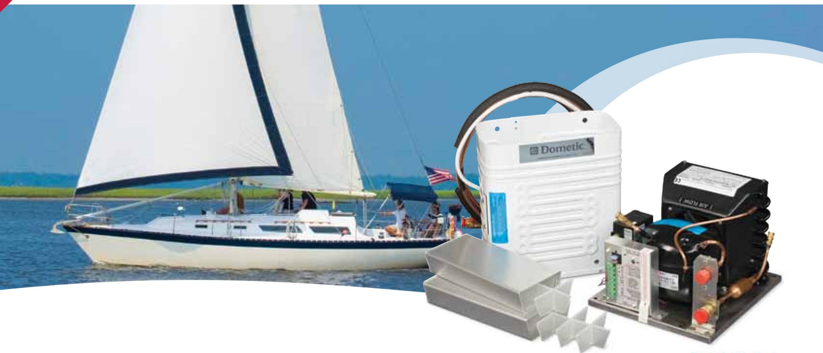
CU-100 ColdMachine & VD-150 Evaporating Unit (shown with ice trays)

Performance, efficiency, and quality are hallmarks of Adler/Barbour ColdMachine Kits by Dometic. Two configurations are offered: The air-cooled CU-100 ColdMachine, and the air- and water-cooled CU-200 SuperColdMachine. Powered by a Danfoss BD50F compressor, these easy-to-install units provide up to 15 cu. ft. (424 liters) of refrigeration and work with a variety of 100-Series evaporators (see reverse side).